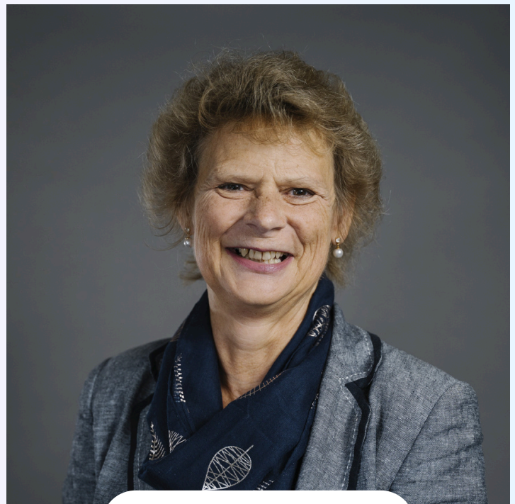
YOUR HR EXPERT

Set up a 15 minute exploratory call at www.crafnanthr.co.uk