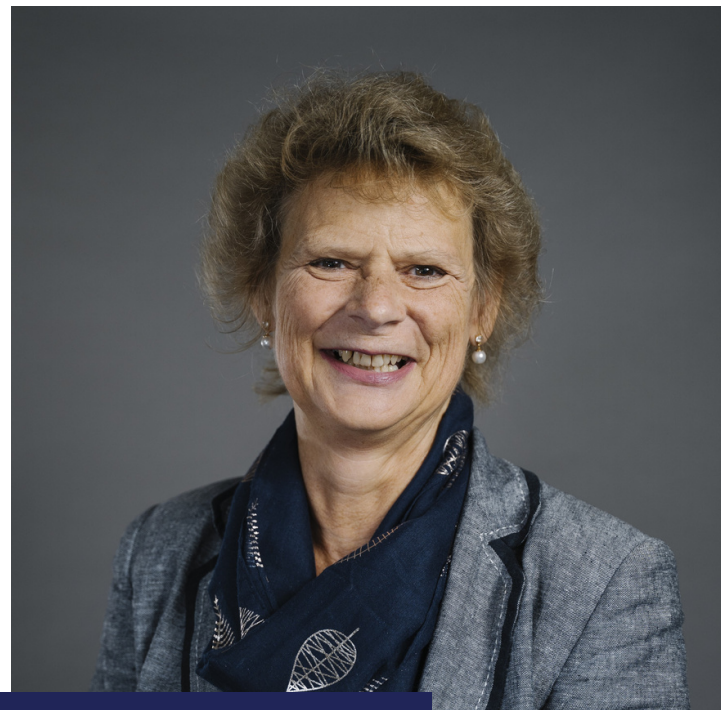
YOUR HR EXPERT

You know just how important it is to get proactive, responsive HR support. That's what we do.